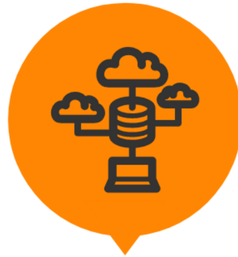
Access API Packages