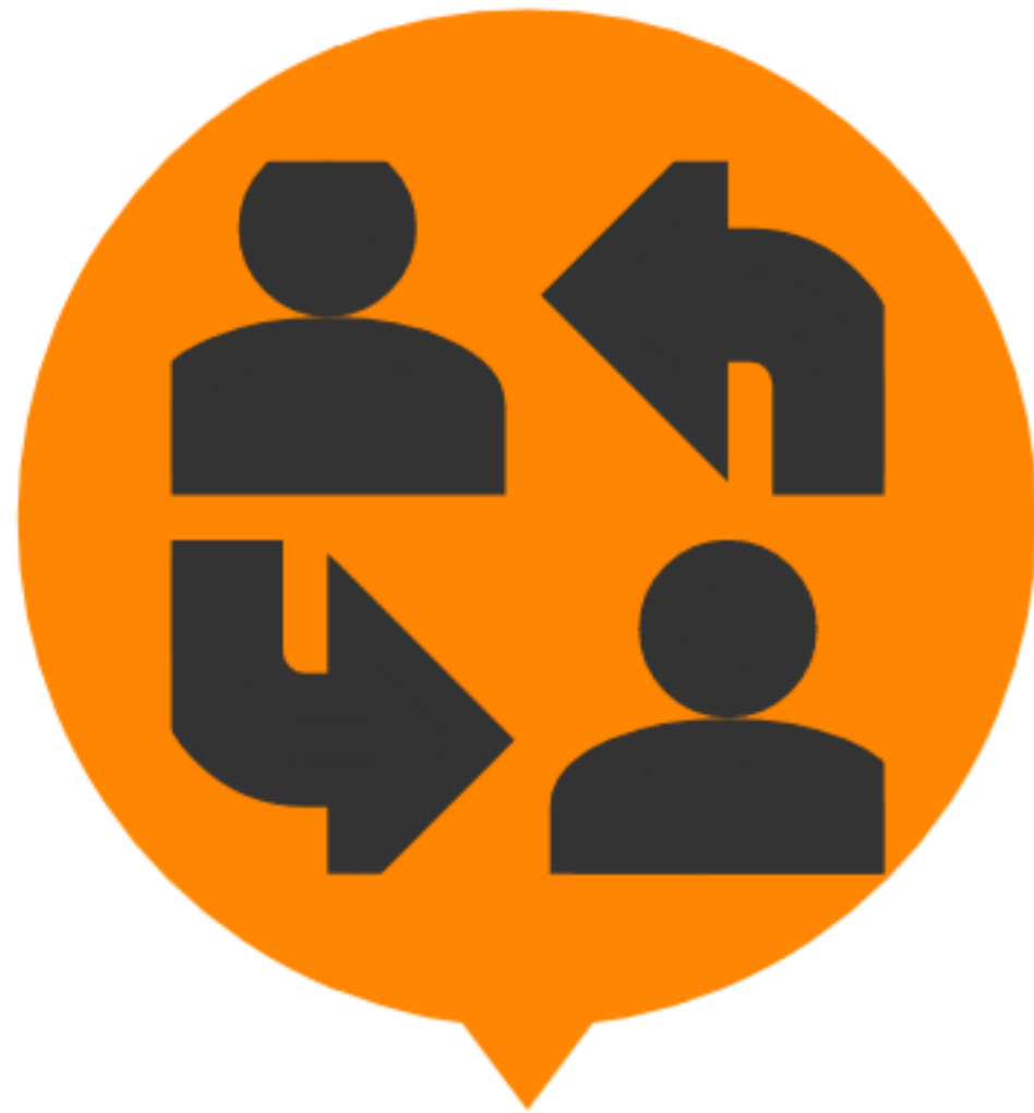
Collaborating with Banks